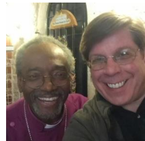
Photo: With Episcopal Presiding Bishop Michael B. Curry at St. George's Cathedral, Jerusalem, on Good Friday 2018.