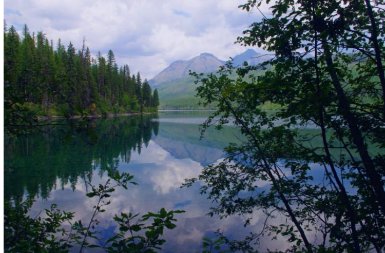
Another gorgeous photo by Ric Tanner