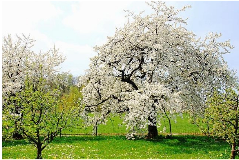
Happy Arbor Day!