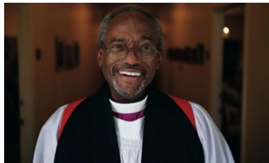
Bishop Curry's Christmas Message

https://www.episcopalchurch.org/posts/publicaffairs/presiding-bishop-currys-christmas-message-2017