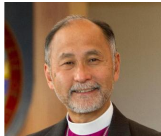
Bishop Hayashi's Advent Message

https://www.episcopalchurch.org/posts/publicaffairs/presiding-bishop-currys-christmas-message-2017